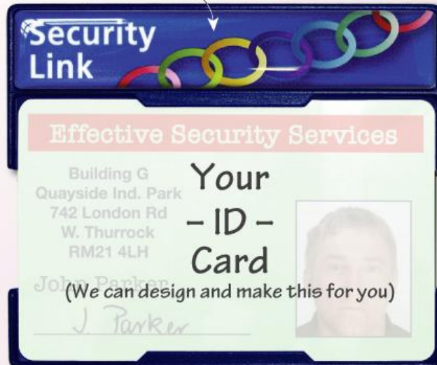
1 IDHN 86x54 (Landscape)