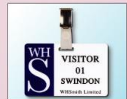
5 Card (Punched)