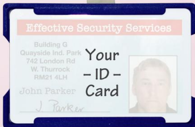
3 CARDH 86x55