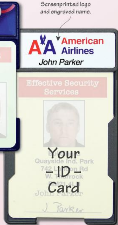
2 IDVN 86x54 (Portrait)