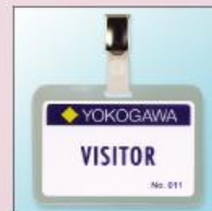
4 IDSTRAP 85x54 (Landscape)