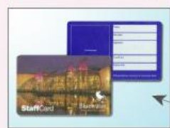
Example showing front and rear, ready for you info.